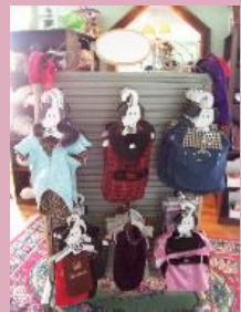
Renaissance Pet Resort & Spa